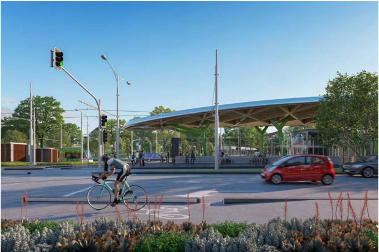
Artists impression of St Kilda Road after the completion of the new Anzac Station. Concept only